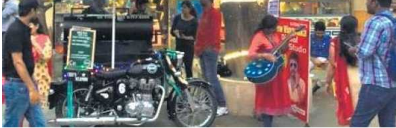
Burger boys on bullet bikes